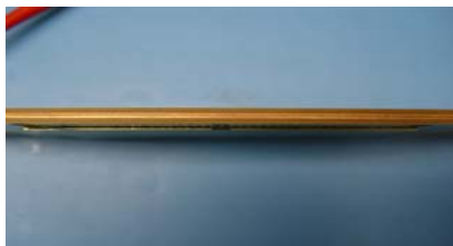
Figure 1. New 3-D CCA Assembly with Imbedded Components.