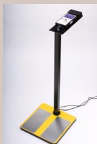
Static Detection Meters