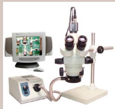
Video Inspection System