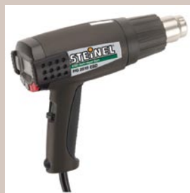
Hot Air Guns