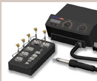
Hot Air Rework Station