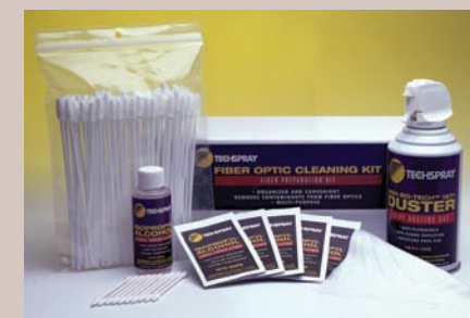
Fiber Optic Cleaning Products