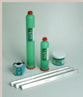
Kester Lead Free Solders

We also stock video inspection systems, hand tools, chairs, and workbenches.