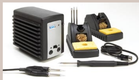
Multi-Functional Rework Systems

Placing orders with STI is easy! Sometimes, you may not know the part number or the manufacturer of an item, which can be a problem with most distributors. We'll work with you, do the research and get the right information on the product you are looking for. We will provide free quotations, with no obligation to buy. We'll even guarantee the price for thirty days! When you submit an order, be assured that it is processed immediately and accurately. We are able to take orders via telephone, email and fax for your convenience. With our on-site product warehouse, we can assess stock availability and accurately check on the status of your order. We offer you value-added services that are flexible enough to suit any company, small or large.